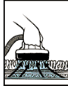
Rinse and extract solution and urine