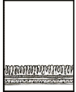
No more spot!