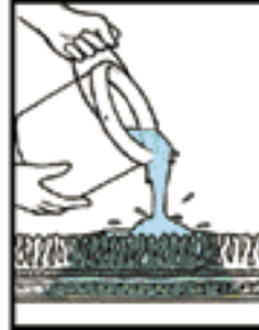
Saturate area with deodorizer